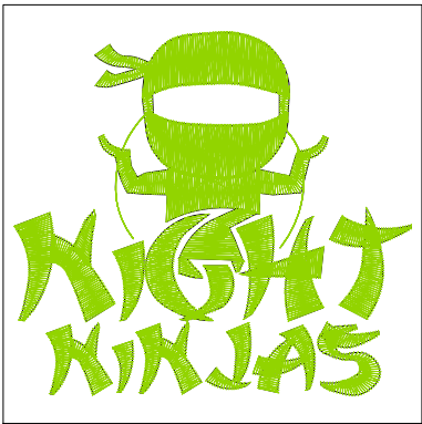
Stop #: 3 Element: Code: H-100-1091 Name: Green Apple Chart: Hemingworth Stitches: 4,561 Thread used: 26.30m