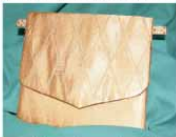
Purse shown without lace