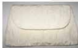
Corners can be turned up for a different look