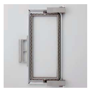
Continuous border frame* The Continuous Border Frame offers a large 300 x 100mm (12" x 4") embroidery area enabling you to repeat rows of designs vertically or horizontally with more accurate alignment.

Brother's range of embroidery design software offers features to suit all, from beginner to advanced users.