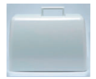
Included with NS35 and NS55

A spring action, clear quilting foot marked for easy reference that handles a variety of fabric thicknesses.