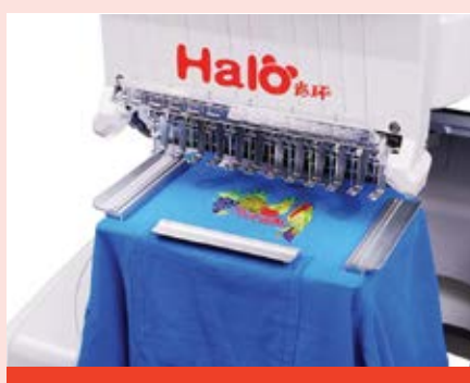
Magnetic Frame Set