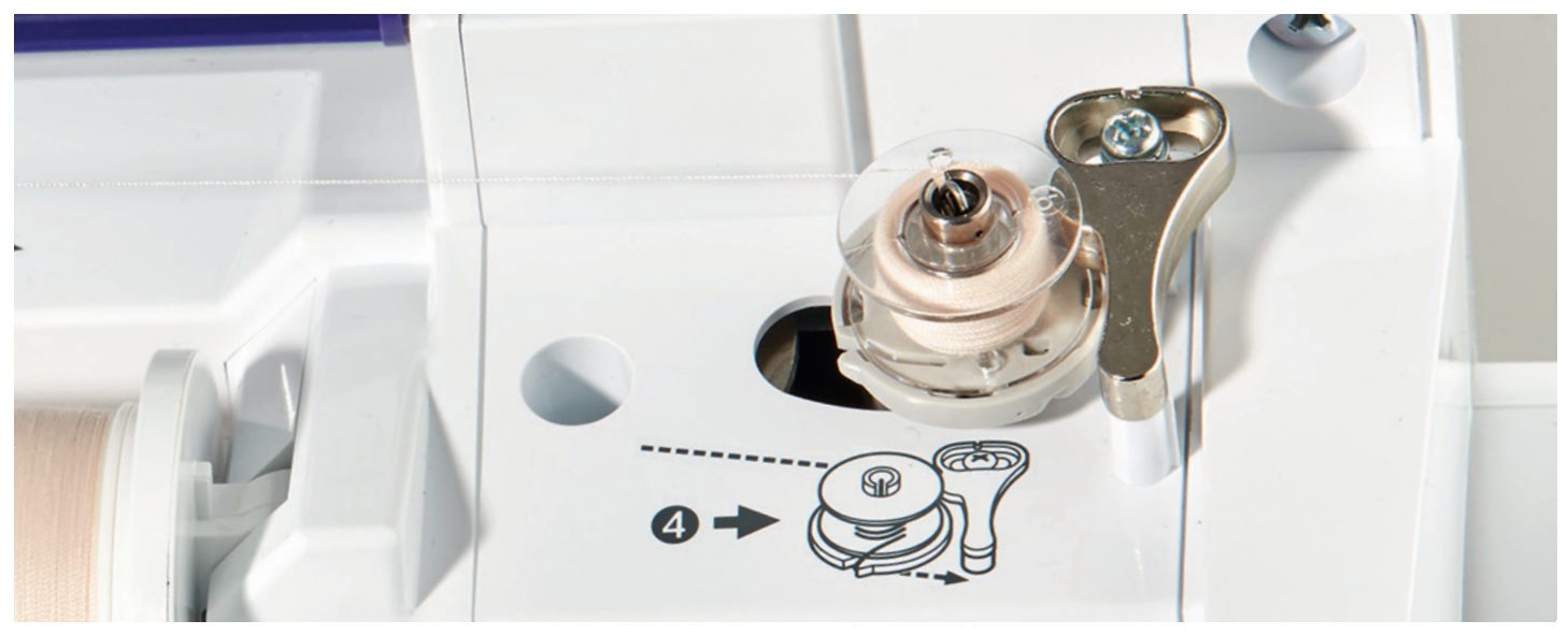
Bobbin winding system

Express your creativity in unlimited ways with the Innov-is F420. Whether you are new to sewing or an expert, this machine allows you to enjoy creating everything from fashion to home furnishings.