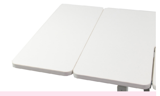
Extension table included (max weight 10kg)