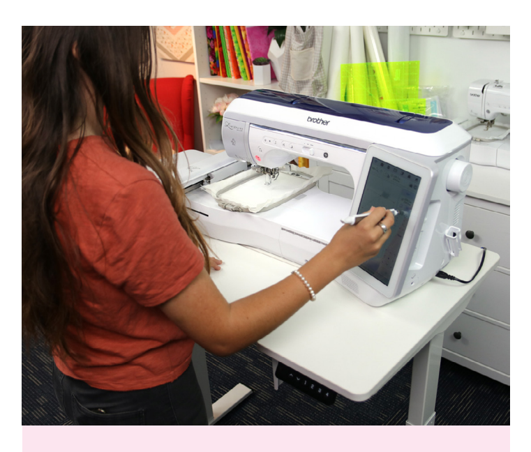
Stand and embroider