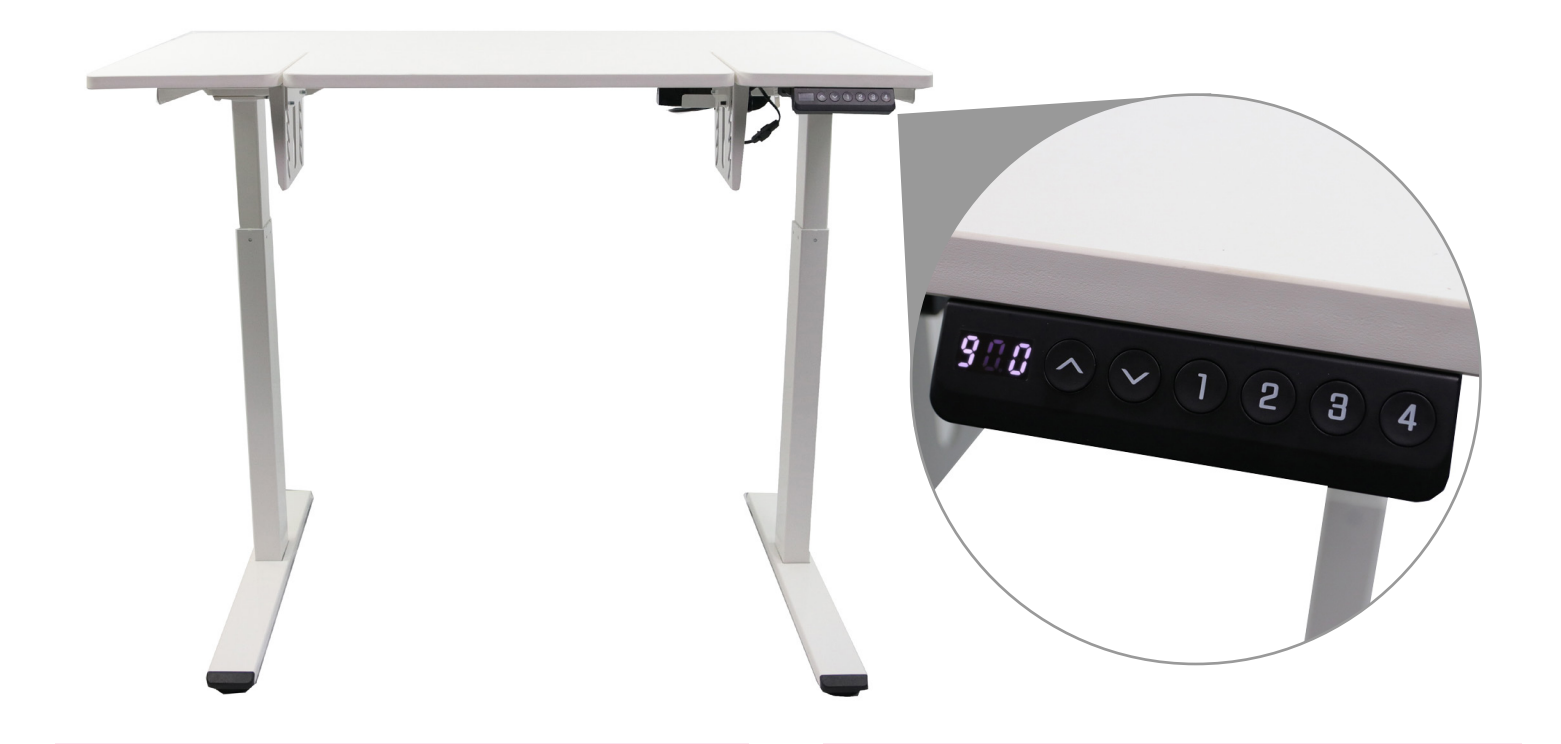
Compact with large workspace