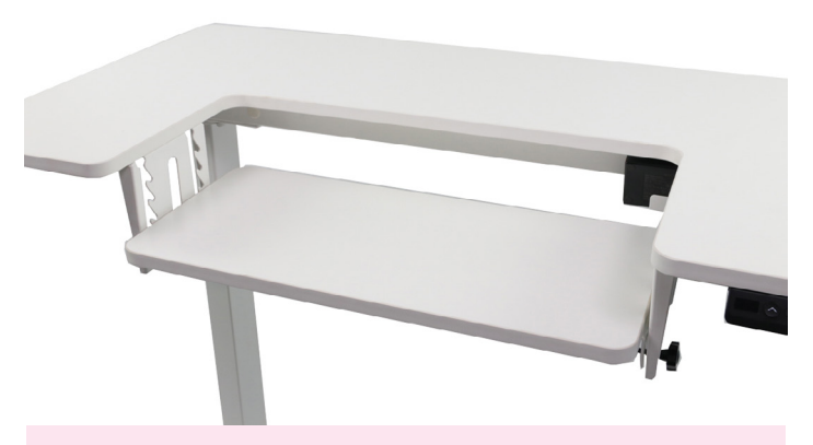
Lowering sewing platform (max weight 12kg)