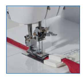
Belt loop guide