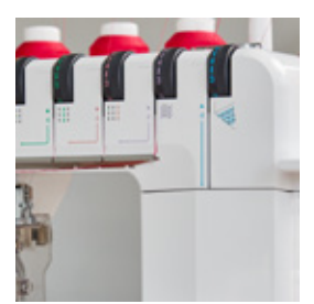
5 colour easy threading guide

The Brother CV3550 Double-Sided Cover Stitch machine offers coverhem functionality for a high-quality, sophisticated finish. Easy handling and user-friendly threading systems make hemming and topstitching fabrics and garments a breeze.