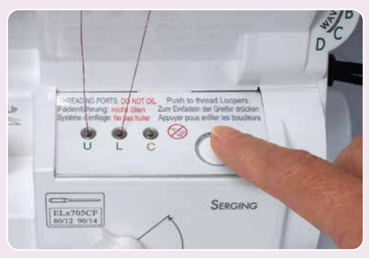
ExtraordinAir™ with Tubular Loopers allows you to thread in any order and avoid tangles and knots as threads are not exposed.

The tubular loopers also prevent the threads from tangling, and by keeping the threads completely separated within the machine, the loopers can be threaded in any order. They also allow you to change any thread without having to re-thread the others.