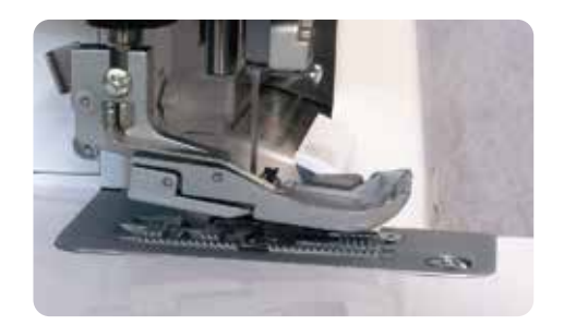
6mm Presser Foot Height allows you to easily work with thicker fabrics.