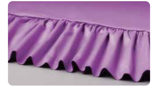
True 2 to 1 Differential Feed ensures more consistent gathering of fabrics and compensates for stretch distortion on your knits.