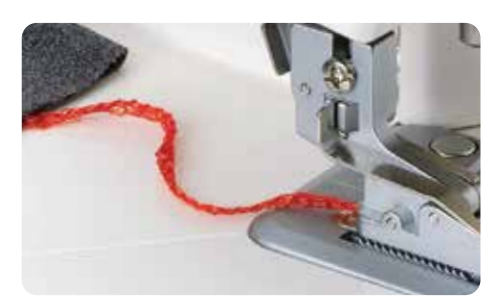
Coverstitch chain off makes starting and stopping your coverstitch easier than ever.