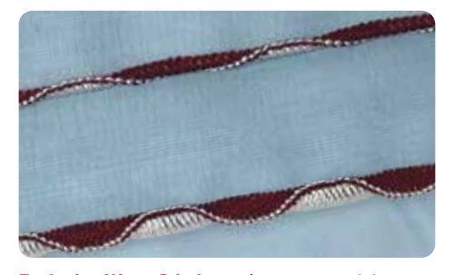
Exclusive Wave Stitch to take your creativity to new levels.