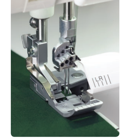
Vertical Needle System – All Models Minimises needle deflection and decreases needle breakage.