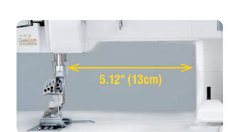
Industry-leading Throat Space Give your projects the space they deserve.