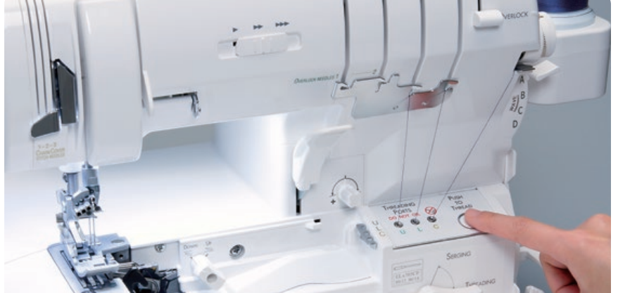
Simply push the button and air blows the thread through the tubular loopers.

See available accessories & compare model specifications