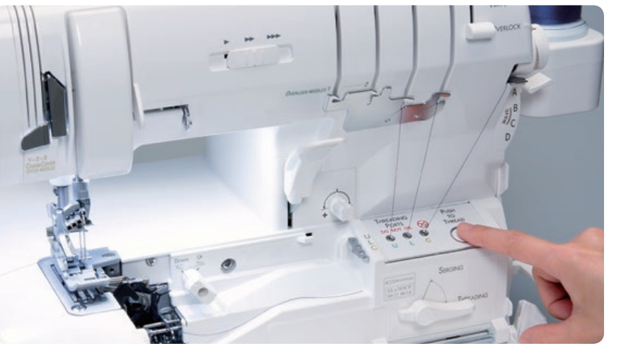
ExtraordinAir™ Threading - Ovation & Evolution Only