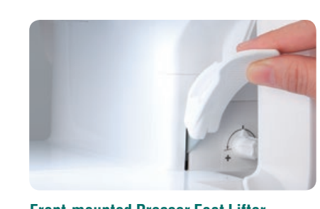
Front-mounted Presser Foot Lifter