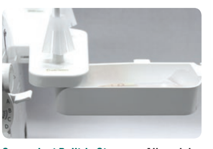
Convenient Built-in Storage - All models