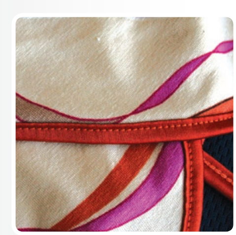
Double Fold Bias Binder - All Models