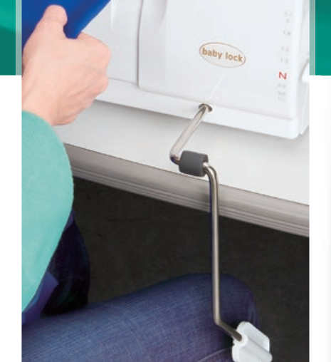
Removable Knee-lift Maintain complete control with hands-free operation of the presser foot lifter.