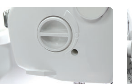
Adjustable Presser Foot Pressure Easy and convenient dial control.