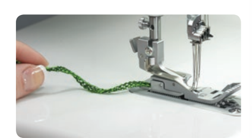
Continuous Coverstitch Chain-off