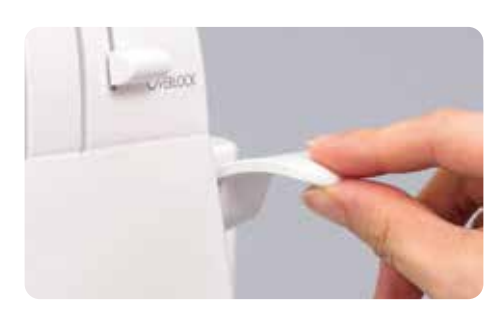
Easy-access Presser Foot Lever on the right side of the machine lets you quickly lift the presser foot.