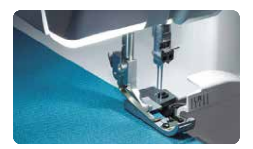
3 Powerful LED Lights flood your workspace with bright and even lighting.