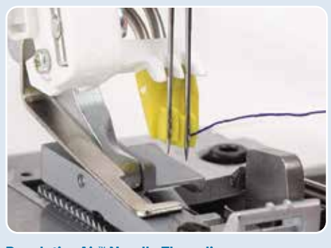
RevolutionAir™ Needle Threading Hold the thread in front of the needle, and with the push of a button the needle is threaded –