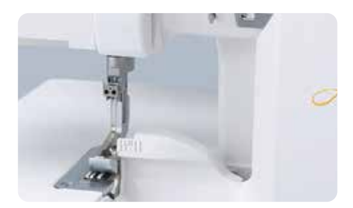
2-Inch Throat Space lets you easily create large projects with room to spare.