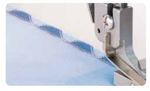
Exclusive Wave Stitch to take your creativity to new levels.