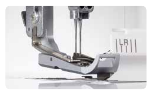
6mm Presser Foot Height allows you to easily work with thicker fabrics.