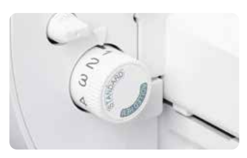
Automatic Rolled Hem via a simple dial retracts the built-in stitch width finger.