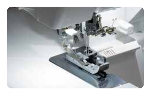
3 Powerful LED Lights flood your workspace with bright and even lighting.