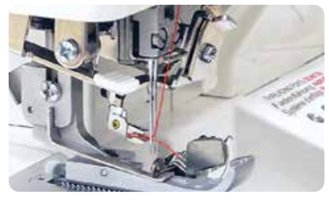
Built-in Needle Threader for easy, stress-free needle threading, every time.