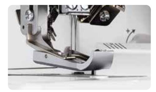
6mm Presser Foot Height allows you to easily work with thicker fabrics.