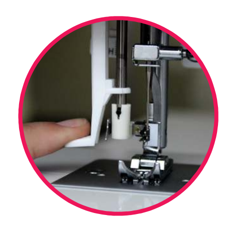
Automatic needle threader