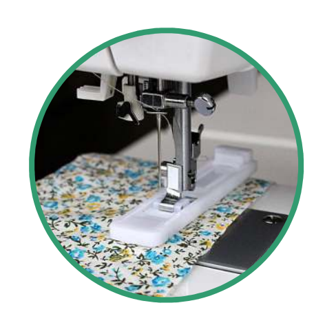
One step automatic buttonhole