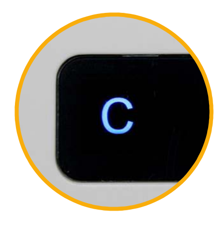
Illuminated stitch viewer